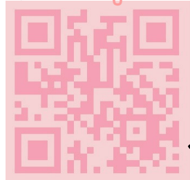
WOMENS APRIL '24

Exciting News — We are going digital in 2024