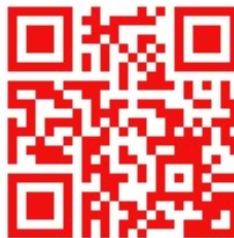
MENS JUNE '24